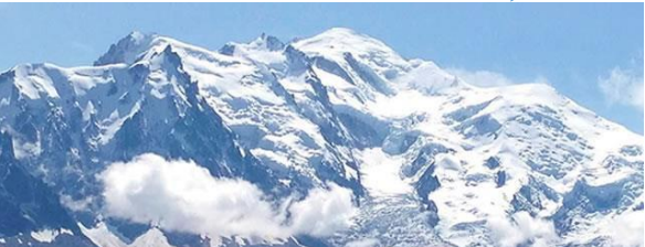
Direction of Mont Blanc